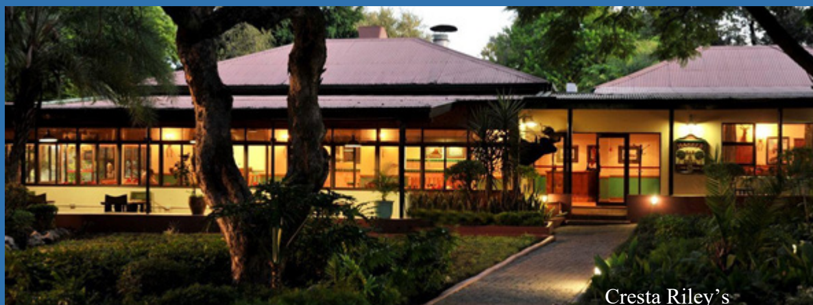
Overnight Cresta Riley's

Cresta Riley's Hotel has a long history of meeting the needs of travelers seeking authentic African experiences as well as modern comforts. The hotel facilities include comfortable accommodation, a swimming pool, fitness center, Internet, satellite television, and a selection of fine dining.