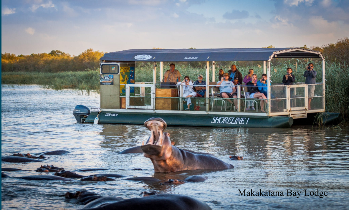
Makakatana Bay Lodge

The iSimangaliso Wetland Park was listed as South Africa's first World Heritage Site in December 1999 in recognition of its superlative natural beauty and unique global values. The Park contains three major lake systems, eight interlinking ecosystems, 700-year-old fishing traditions, most of South Africa's remaining swamp forests, Africa's largest estuarine system, 526 bird species and 25,000-year-old vegetated coastal dunes – among the highest in the world. Here we can relax in luxury, take walks in the sand forest, and enjoy the memories of our wildlife adventures.