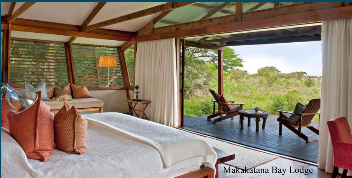
Makakatana Bay Lodge