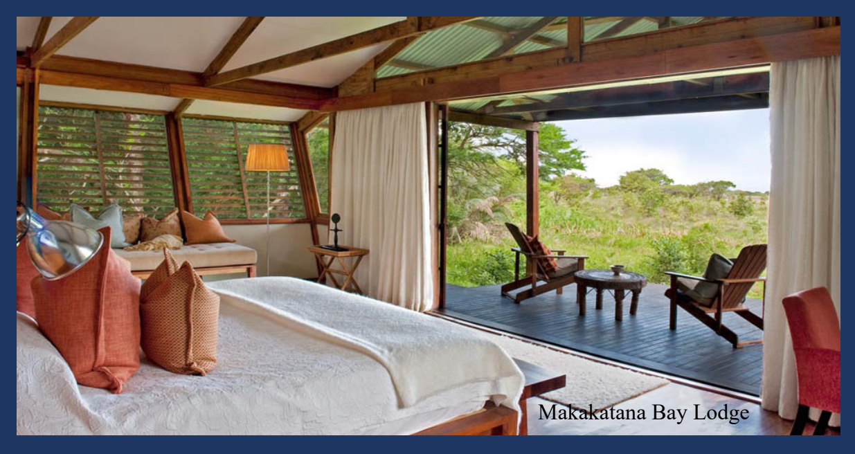
Overnights Makakatana Bay Lodge