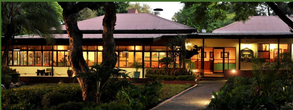
Overnight Cresta Riley's Hotel

As the first hotel established in Maun, and a landmark since the early 1900s, Cresta Riley's Hotel has a long history of meeting the needs of travelers seeking authentic African experiences as well as modern comforts. The hotel facilities include comfortable accommodation, a swimming pool, fitness center, Internet, satellite television, and a selection of fine dining.