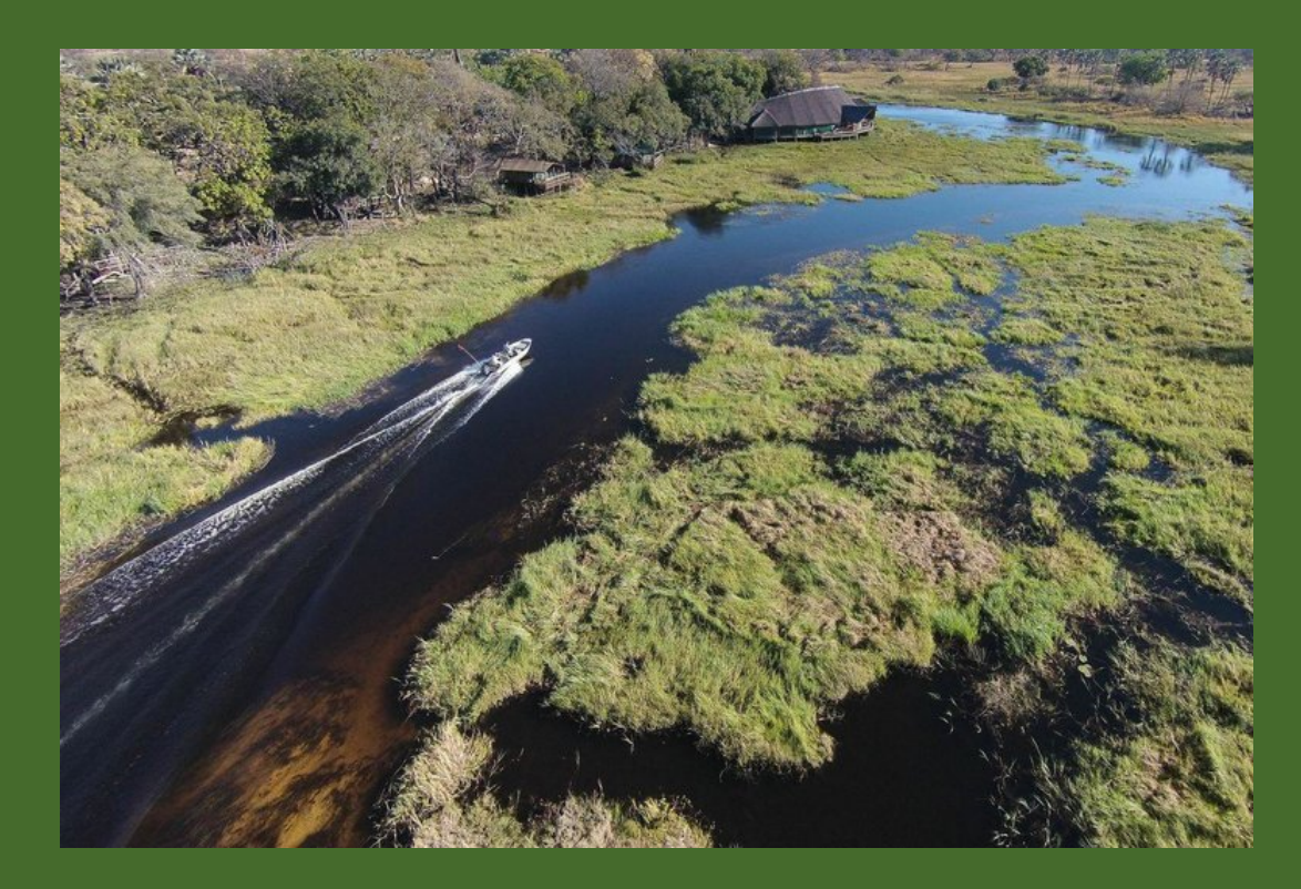
Day 12, 17th May: Departure Day

Following breakfast and we will leave Moremi and fly to the Maun airport for your departure flight back to Johannesburg, where sadly this tour will come to an end. We wish you a safe journey to your destination. We thank you for your participation in this very memorable tour.