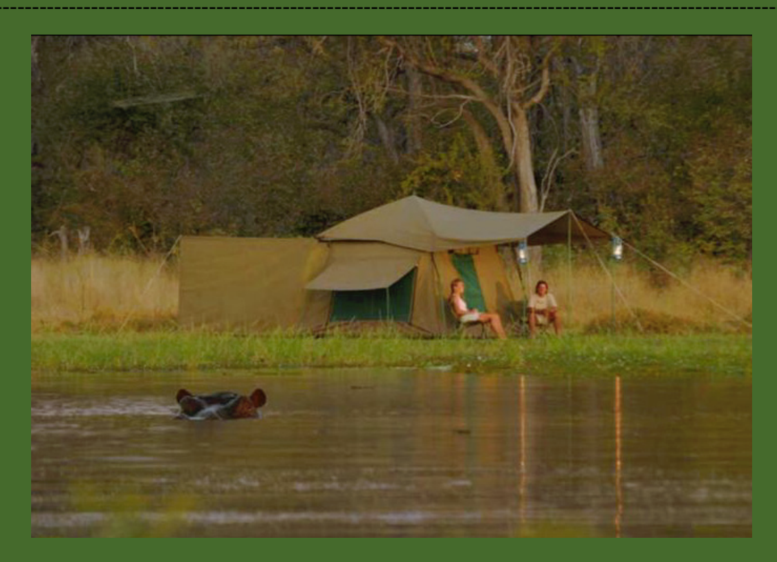
Day 9, 14<sup>th</sup> May: Transfer back to Maun

After a final early morning game drive/walk and breakfast, we will depart for a couple hour drive to Maun where we will stay for one night. Maun was made famous by the novel, No 1 Ladies' Detective Agency and the later TV series. We can relax at our lodge located along the Thamalakane River, reminisce on our adventures, and visit the town's many attractions.