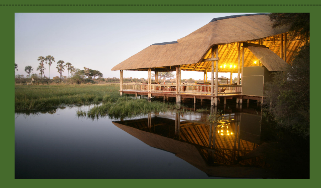
Day 11, 16<sup>th</sup> May: Moremi Crossing

Another full day of activities including walking, canoeing, and boating safaris.