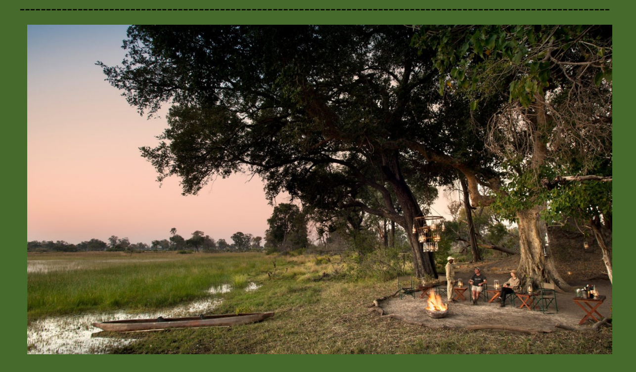
Day 3 -8, 8th - 13th May: Six full days walking and tracking in the Okavango Delta.

Over the next six days we will be sharpening our observation skills and learning to identify tracks and scat and interpret a variety of animal behavioral signs.