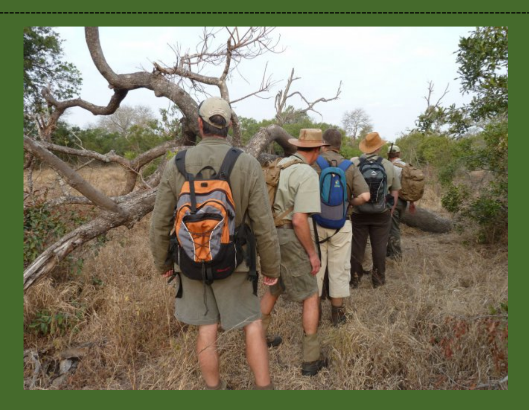
Day 6, 12<sup>th</sup> May: Transfer from Thanda Reserve to Phinda Private Reserve.

Today will be travel to Phinda Private Game Reserve. We will leave Thanda with all our luggage and enjoy a short road transfer to Phinda Private Game Reserve which will be our base for the next 4 nights. We will arrive at Phinda Reserve in the early afternoon and have lunch. Accommodation is in a tented camp with a fan and en suite bathroom.